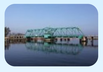
Recruitment Announcement: 0315-RC1006-01